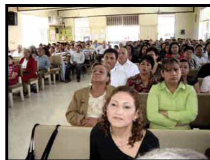
Bible Baptist Church