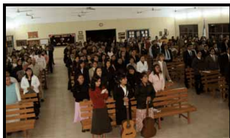
2 nd Semester Opening Night